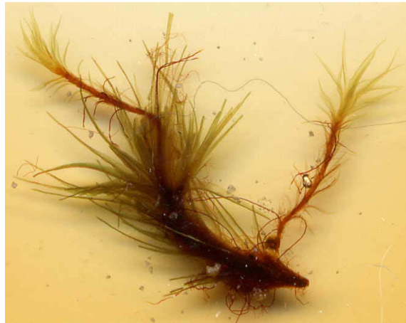
Illustration: Tortella fragilis producing T. tortuosa -type branches in cultivation on nutrient solution

directly reveal the tree-like or networked evolutionary past than does standard phylogenetic analysis that uses presumably evolutionarily neutral (I.I.D.) non-coding and non-regulatory DNA, or synonymous codons to create nested sets of events of inferred genetic isolation following the Biological Species Concept.